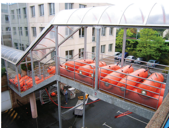
Pedestrian bridge test at 12000 Kg.