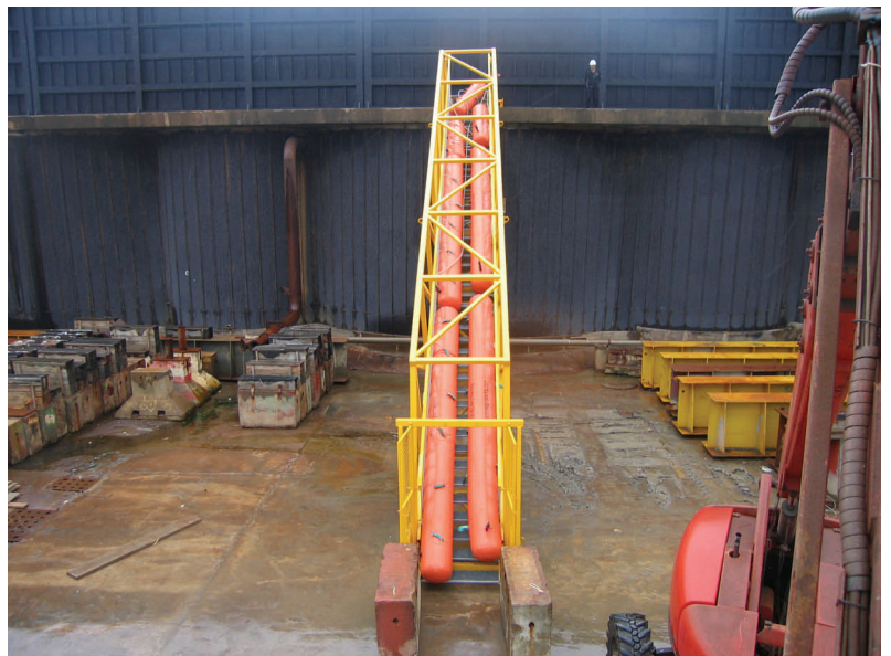
Gangway test at 5050 Kg.